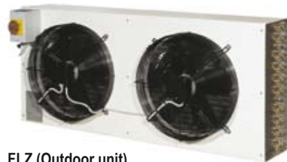
FLZ (Outdoor unit)

FL dehumidifiers series are high-performances units especially designed for industrial or commercial purposes where humidity level should be controlled or water vapour condensation should be prevented. These units are particularly indicated for archives, ironing rooms, bookstores, cheese factories, underground rooms, cellars and industrial sites where high humidity level is present. This series comprises 3 basic models which cover a capacity range from 564 to 940 l/24h. FL units are designed for easy maintenance and service, each part being readily accessible and, when required, easily replaceable thus reducing service and maintenance costs.